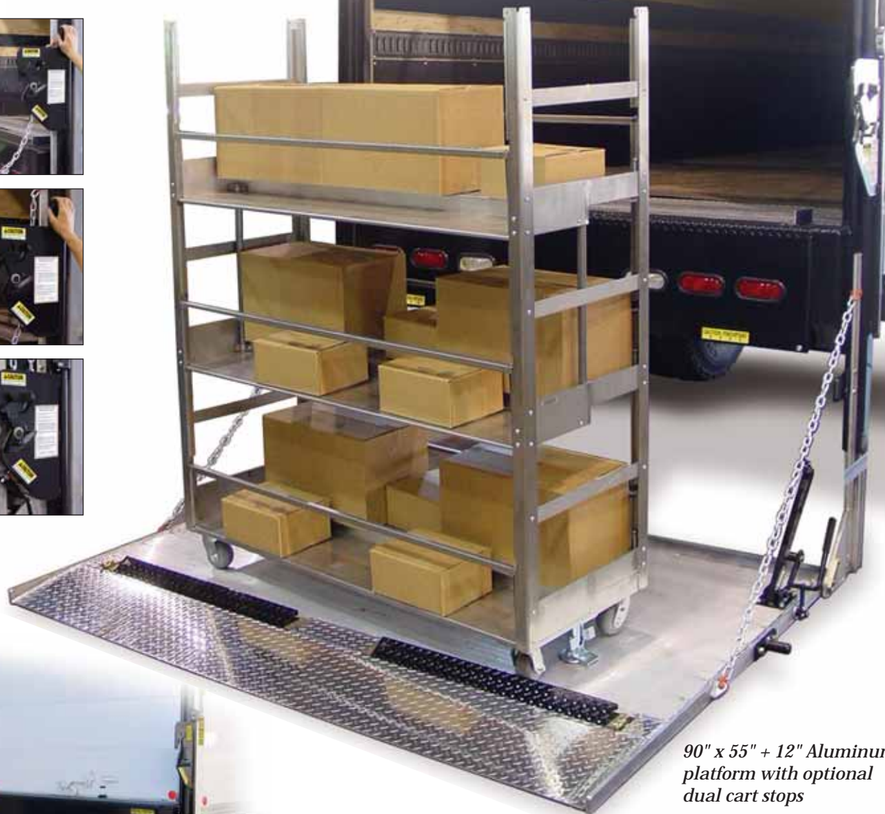
90" x 55" + 12" Aluminum platform with optional dual cart stops