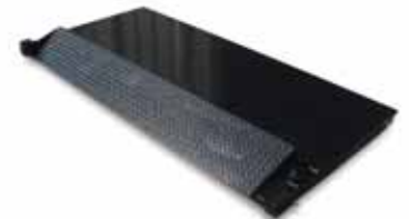
12" pop-up cart stop (Standard on 60" & 72" models)