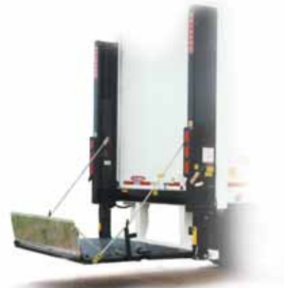
Optional 16" aluminum retention ramp for 60" & 72" model (Standard on 84" model)