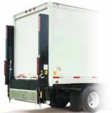
Optional bed height model in stored position (All capacities)