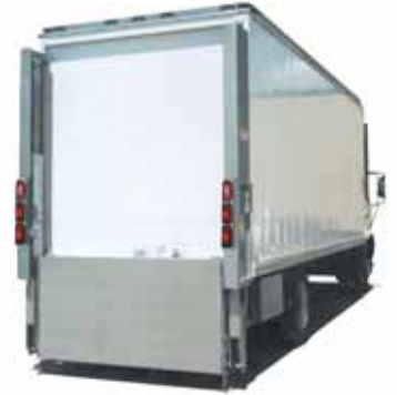
Gate shown in lowered position for dock loading

Thick, 5/16 inch vertical rails and 1/2 inch thick overlays on the lower rail creates massive 13/16 inch thick dock contact area.