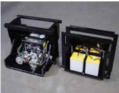
Optional AGM batteries sold separately

2-part galvanneal steel, powder coated assembly. Pumps and motors