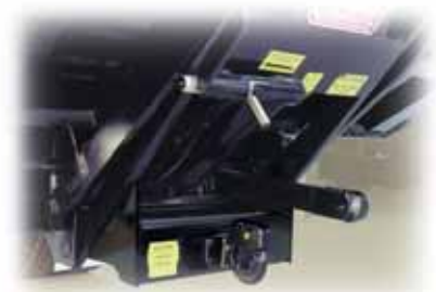
Optional 5 & 12 ton Pintle Hook Brackets