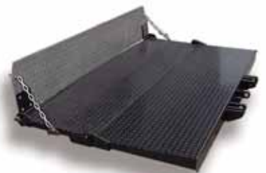
Optional 80" x 48" + 12" Steel Platform with Aluminum Retention Ramp