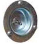
Recessed Toggle Switch (optional)