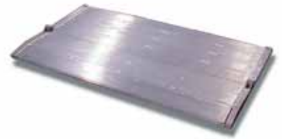
Optional 80" x 45" + 6" Aluminum Platform model, includes Power-Down operation

Used at all pivot points, these pins provide long-life protection from rust, road salt, and moisture.