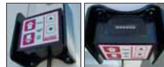
Optional Low Voltage Control Switch saves downtime.

★ AST-Plus covers both Low and High Bed Heights from 38" to 56" in one complete package.